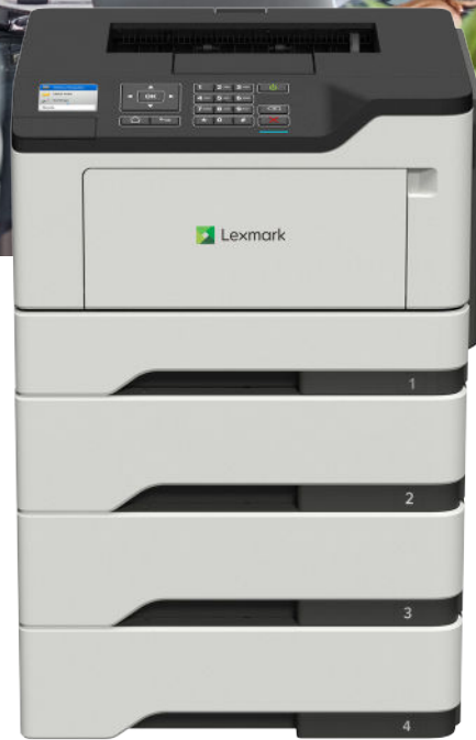
M1246 with optional trays