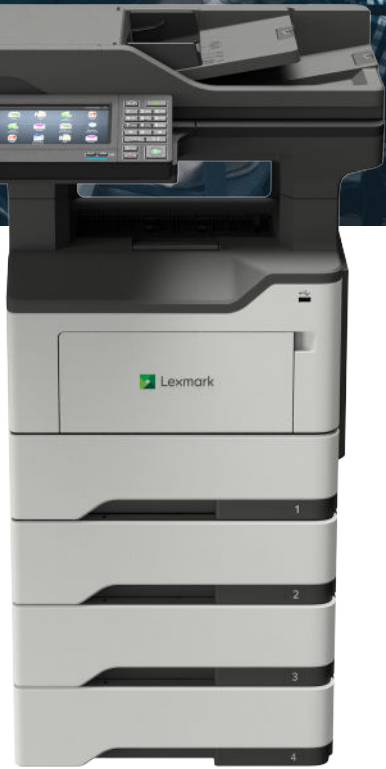
XM3250 with optional trays