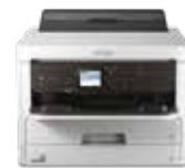
WorkForce Pro WF-C5290 Print