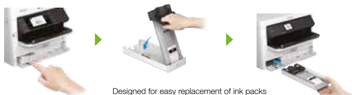
Designed for easy replacement of ink packs

* In accordance with ISO 24711/24712. Actual yields will vary for reasons including images printed, print settings, temperature and humidity. Yields may be lower when printing infrequently or predominantly with one ink colour. A variable amount of ink remains in the cartridges after the "replace cartridge" signal. Part of the ink from the first cartridges is used for priming the printer. Ink is used for both printing and printhead maintenance. All inks are used for both black and colour printing.