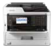
WorkForce Pro WF-C5790 Print/Scan/Copy/Fax/Email