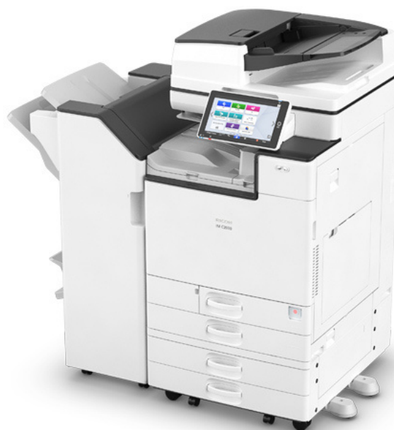
Ricoh IM C Series. IM C2000 pictured with finisher.

With additional finishing options, they also have a 10.1 inch operation panel and support mobile printing.